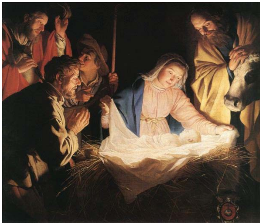
Adoration of the Shepherds by Gerard van Honthorst, 1622